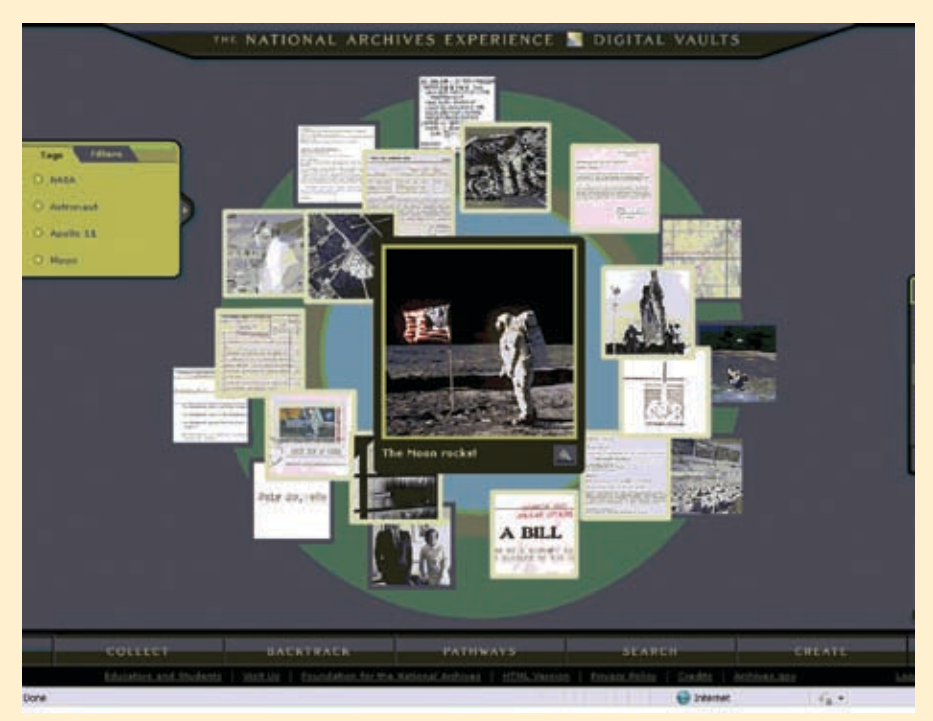
Screen shot from NARA's "Digital Vaults" visual database.